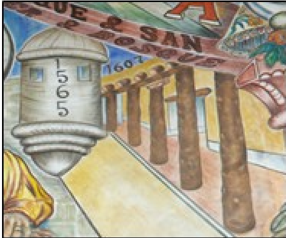
Palace of the Governors (NE3)