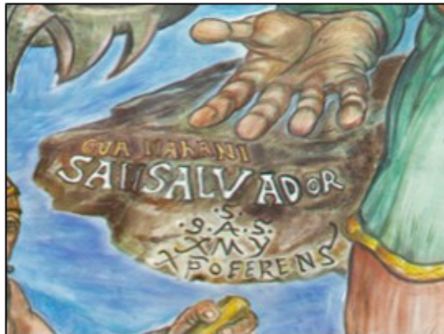
Guanahani, San Salvador (NW9)