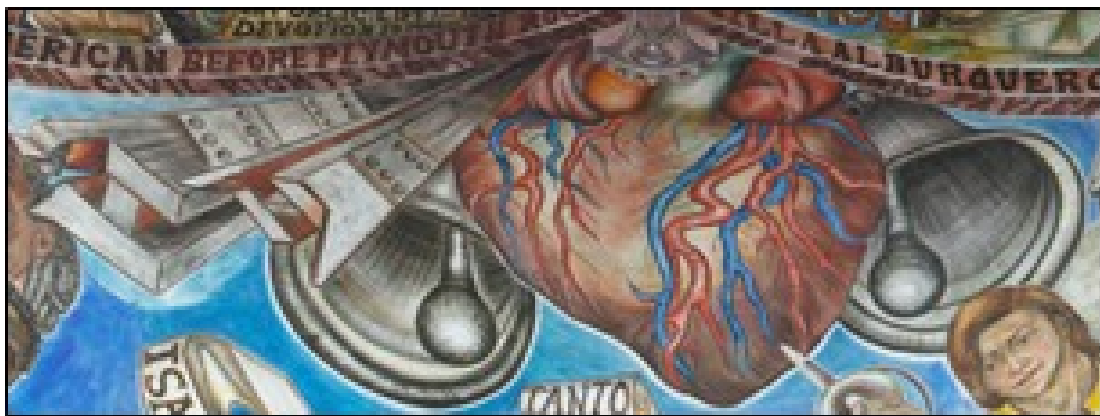
Sacred Heart, Sacred Heart Church (NE1)