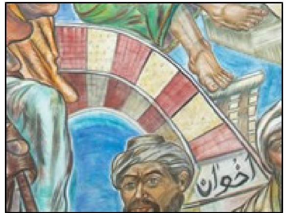
Great Mosque of Córdoba (NE14)